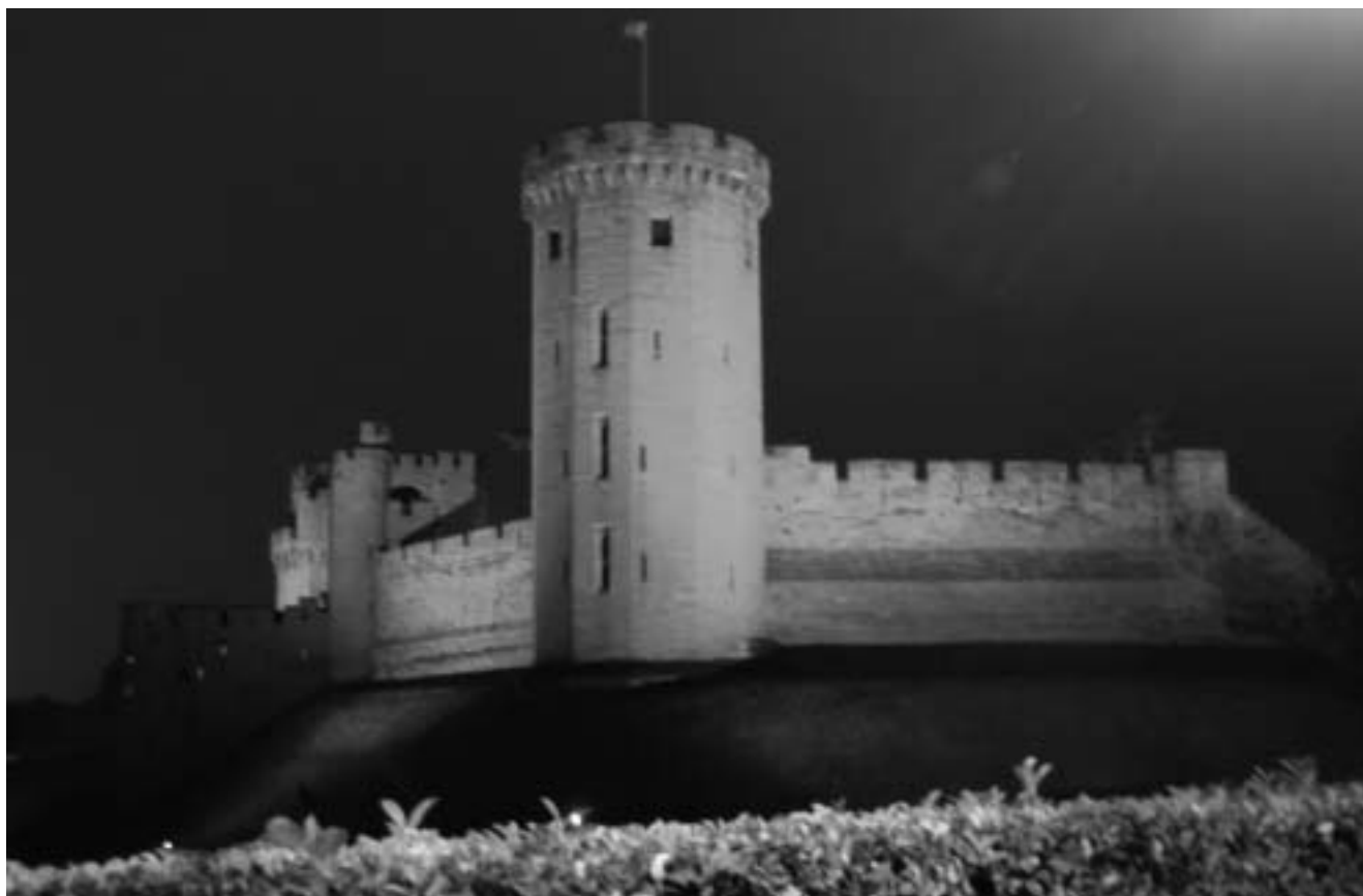
epi 25 th Anniversary Seminar, Warwick Castle