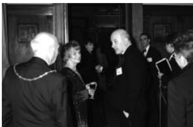
Reception at the inaugural meeting of the epi Council, Munich 8 April 1978